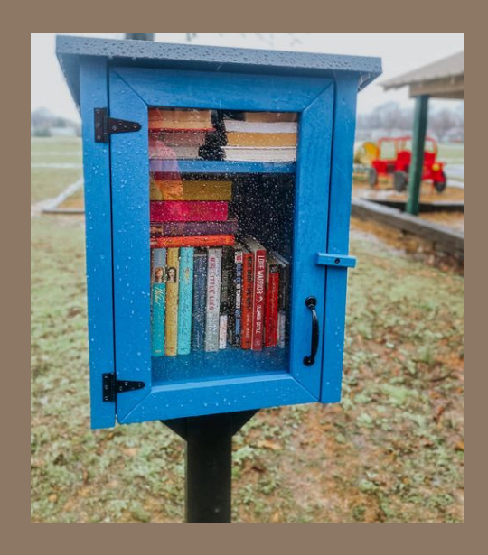
Little Free Library